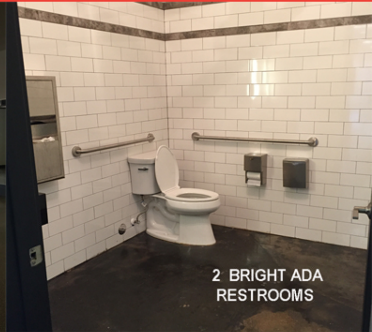
2 BRIGHT ADA RESTROOMS