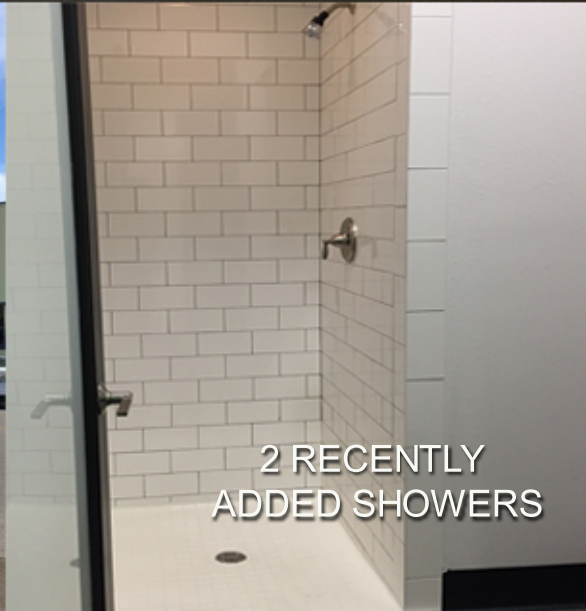
2 RECENTLY ADDED SHOWERS